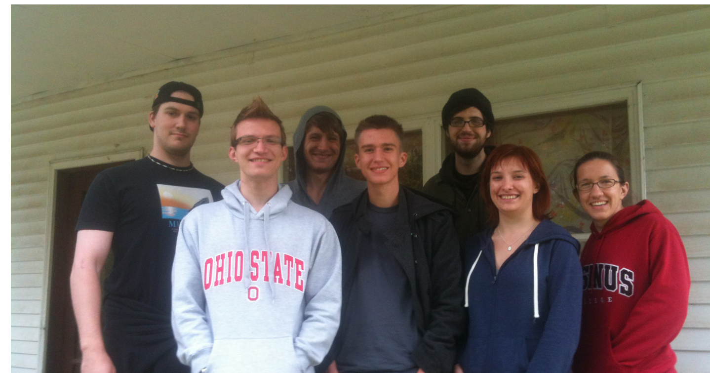
Undergraduate participants at Under the Trees Retreat